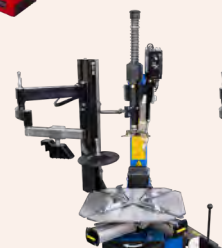
SP2 'Dynamic' Bead Press