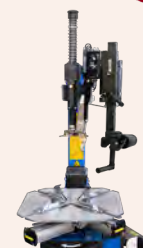
SP1 Bead Press / Lifter