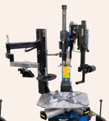
Twin Assist Arms